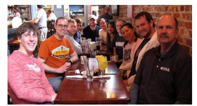
The team relaxes after the race.

The Carts4Hearts Race was a meaningful way for section members to come together to use their engineering talents, promote AIAA and have a good time while helping the needy within the Huntsville community. It was a true team effort. Well done Greater Huntsville!